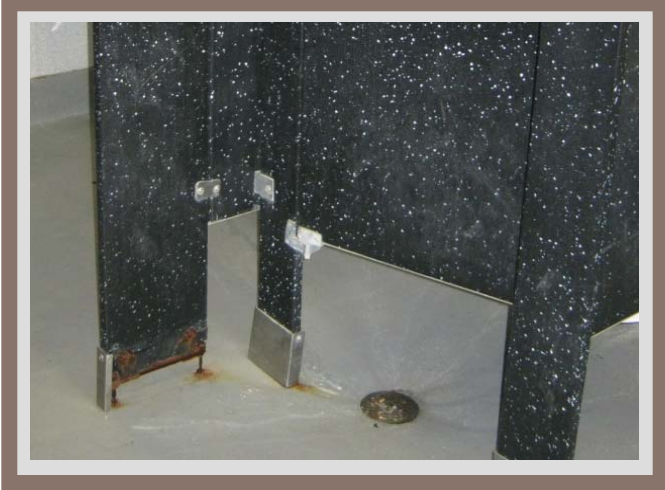
Newark Jr. High School Restroom (Before)