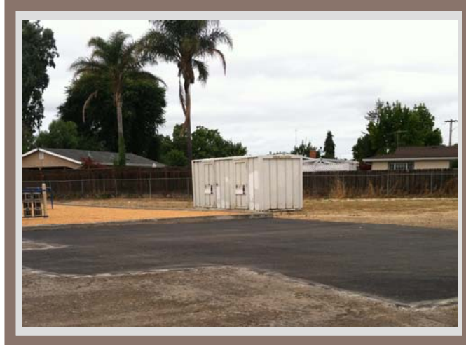
Musick Elementary School Modular Building Removal