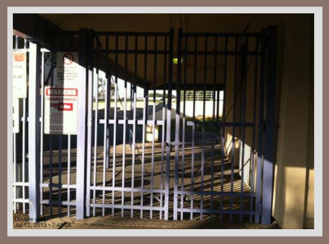
NMHS Gate Replacements and Panic Hardware (Before)