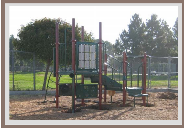
Musick Elementary School Replacement of Playground Apparatus