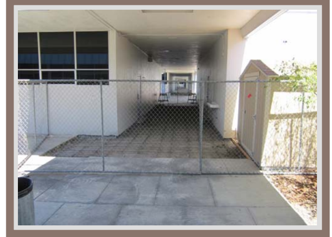
Newark Jr. High School Concrete Replacement