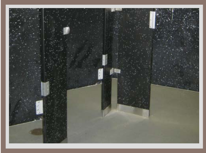
Newark Jr. High School Restroom Replacement