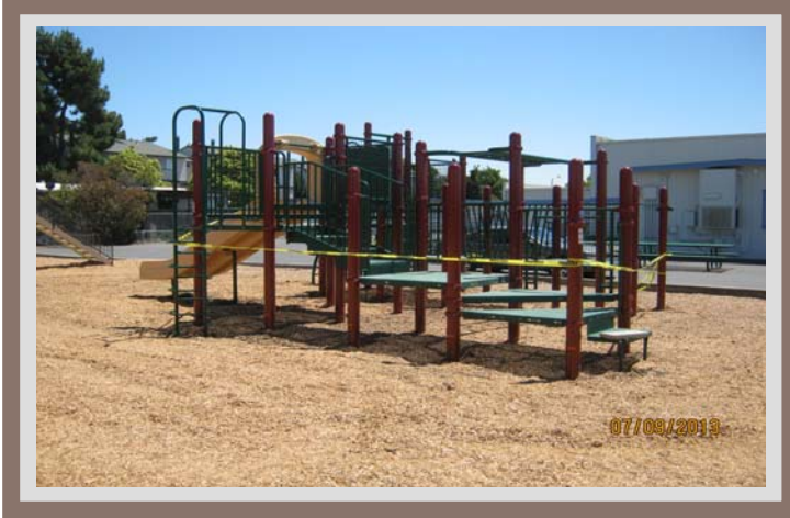
Milani Elementary School Replacement of Playground Apparatus