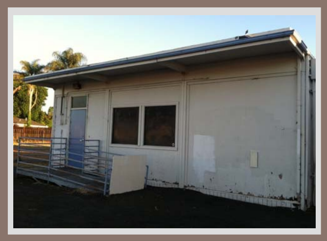
Musick Elementary School Modular Building (Before)